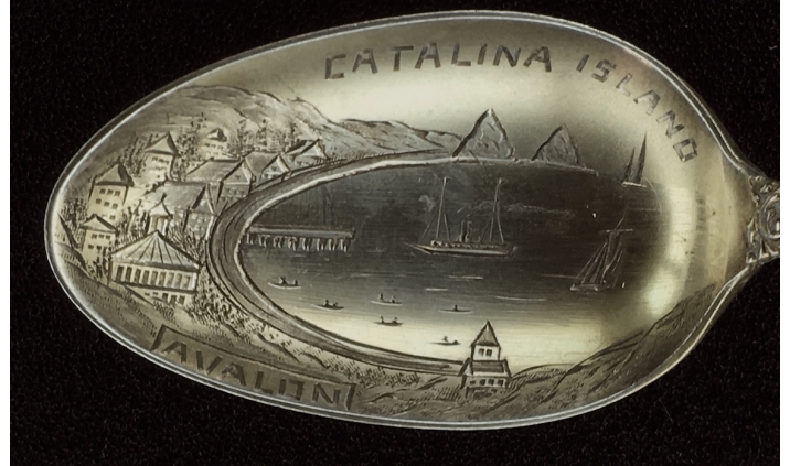
Caption 6, Variety 2 - "Catalina Island Avalon" (C6-V2)

on Gorham Versailles pattern (woman and cherub)